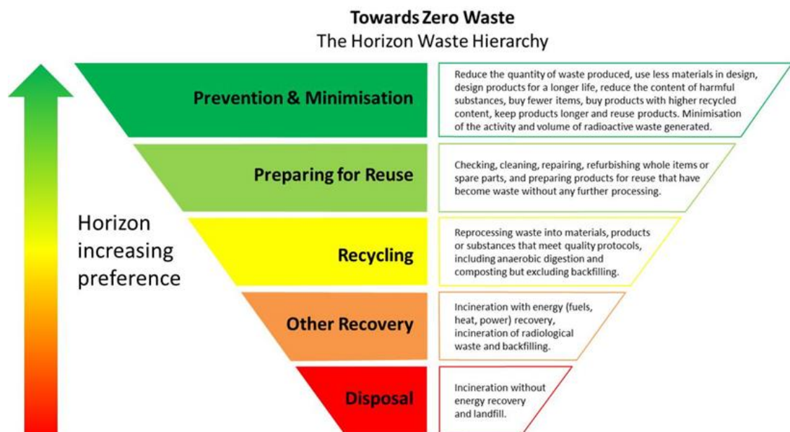
Figure 15-1 The Horizon Waste Hierarchy